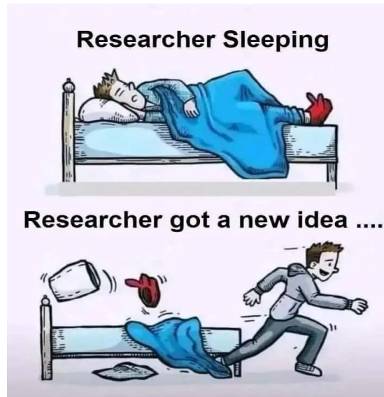
Figure 3. PhD student meme example.

These memes are adopted from Google Scholar. There are many types of memes related to politics, sports, travel, technology, social media, relationships, food, lifestyle, etc.