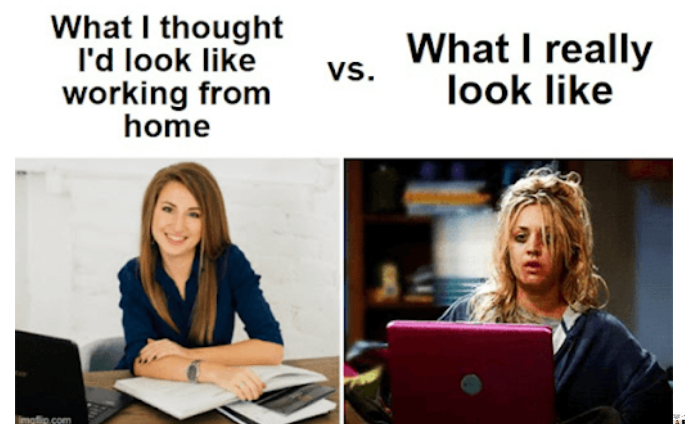
Figure 2. Employment meme example.