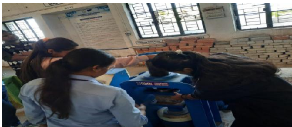
Fig.5 Compressive strength tests were performed at intervals of 7, 14, and 28 days