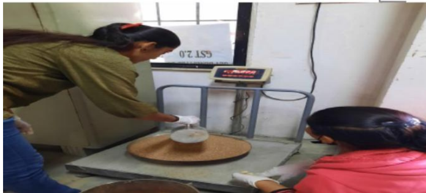
Cubes were demoulded and marked for identification.