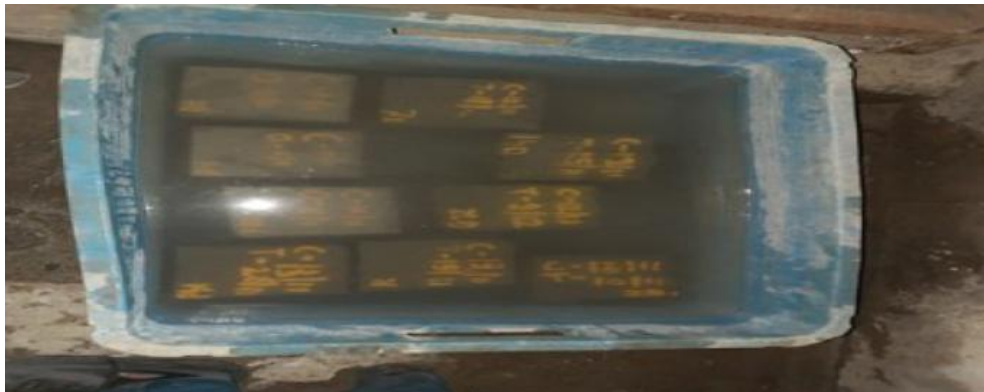
Fig.4 Curing Process of Cubes