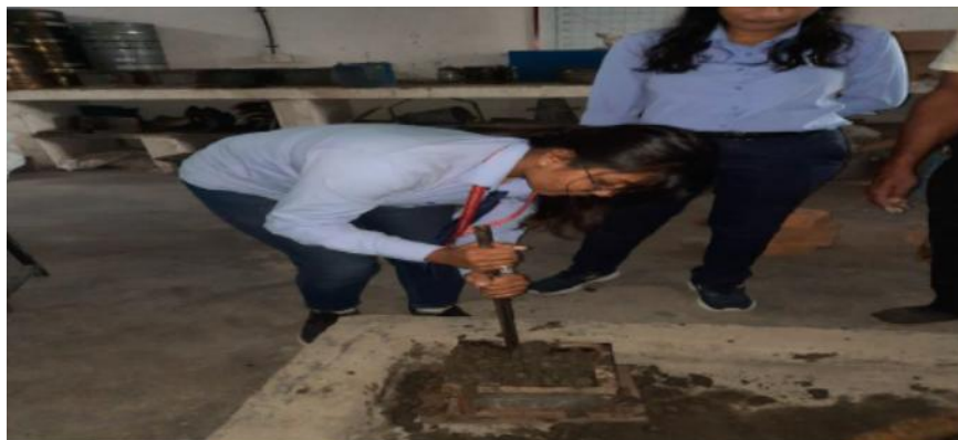
Fig.2 cube compacted using a tamping rod