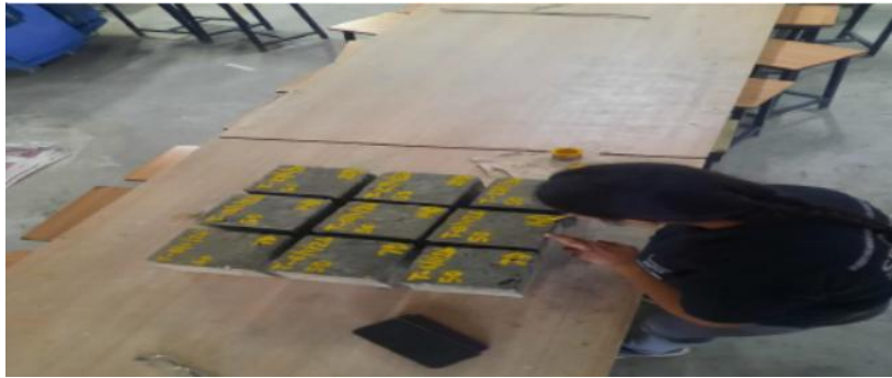
Fig.3 Cubes were demoulded and marked for identification