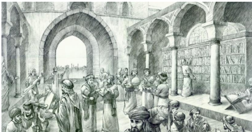
Figure 2. Illustration of activities in Baitul Hikmah, where the rulers listened to scientific and religious experts [http://www.muslimheritage.com/article/house-of-wisdom]

Suppose the relationship between religion and science is poor. In that case, it can result in situations like the Dark Ages (when religion wielded power to suppress science) or the communist era (when science wielded power to suppress religion). However, if the relationship between religion and science is harmonious, then they support each other through power. This was the case during much of the Caliphate era. Muslims must learn to position science, religion, and power appropriately. Missteps in this regard can cause the community to stray further from science or religion, increasing the risk of solidifying secularism.